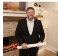
Glenn Adashun Jones, Inc.