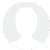
Bob Beiser Realty, LLC