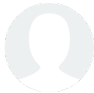
Stephanie Score Realty Group, LLC