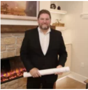
Glenn Adashun Jones, Inc.