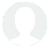
Listing Adashun Jones, Inc.