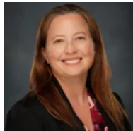
Kate Adashun Jones, Inc.