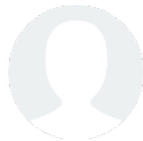
David Ruesch Realty