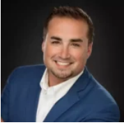
Kevin Adashun Jones, Inc.