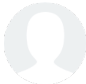
Tyson Adashun Jones, Inc.