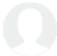
Amy Adashun Jones, Inc.