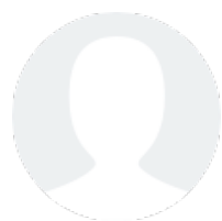
Kyle Real Broker LLC