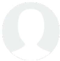
Kyle Real Broker LLC