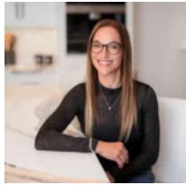
Jodi Adashun Jones, Inc.