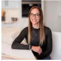
Jodi Adashun Jones, Inc.