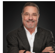
Michael Adashun Jones, Inc.

Location!! Location!! Nice 3 bedroom 1 bath home located across from South Park. large enclosed porch, full basement with outside access, two-car garage, and fenced back yard. Hurry! This one won't last long.