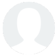
Janneth Bridge Realty Partners