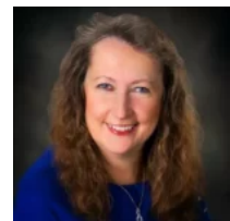
Bonnie Adashun Jones, Inc.

Great potential! Residential city lot available for your home! There was previously a home and garage located on this parcel. All city utilities are available. Bring your plans and make this property yours!