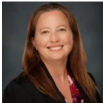
Kate Adashun Jones, Inc.