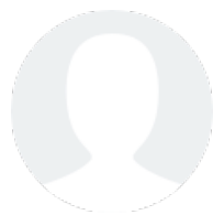
Jessica Design Realty