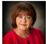
Vickie Adashun Jones, Inc.