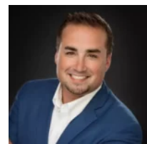
Kevin Adashun Jones, Inc.