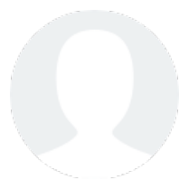
Jason Jason Gerhard & Associates Real Estate