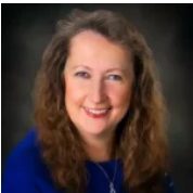
Bonnie Adashun Jones, Inc.

Great Location! 3 Bedroom 1 bath 2 story home located in North Fond du Lac. Formal dining room, nice kitchen, large living room. Open foyer. enclosed back entry. Relax on your front porch! 24x24 detached garage. Make this your next home!