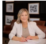
Jan Adashun Jones, Inc.