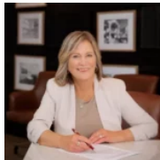
Jan Adashun Jones, Inc.