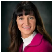
Julie Adashun Jones, Inc.

This spacious ranch is located on beautiful waterfront property. It has 4 bedrooms, master has its own bathroom, 1st floor laundry, and an office. many updates include new carpet in living room, new water softener, new AC, and much more. Kitchen is loaded with cupboards with an open concept to dining area..