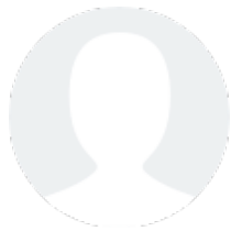
Mike Acre Realty, Ltd.