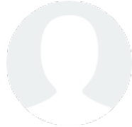
Stephanie Evermore Realty