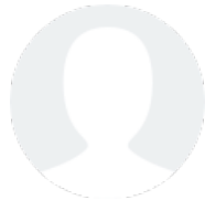
Shawn Evermore Realty