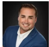
Kevin Adashun Jones, Inc.