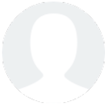
Mike Acre Realty, Ltd.