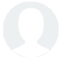
Ryan Corbett Realty