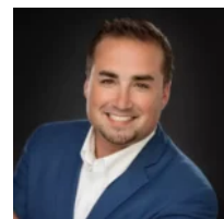
Kevin Adashun Jones, Inc.