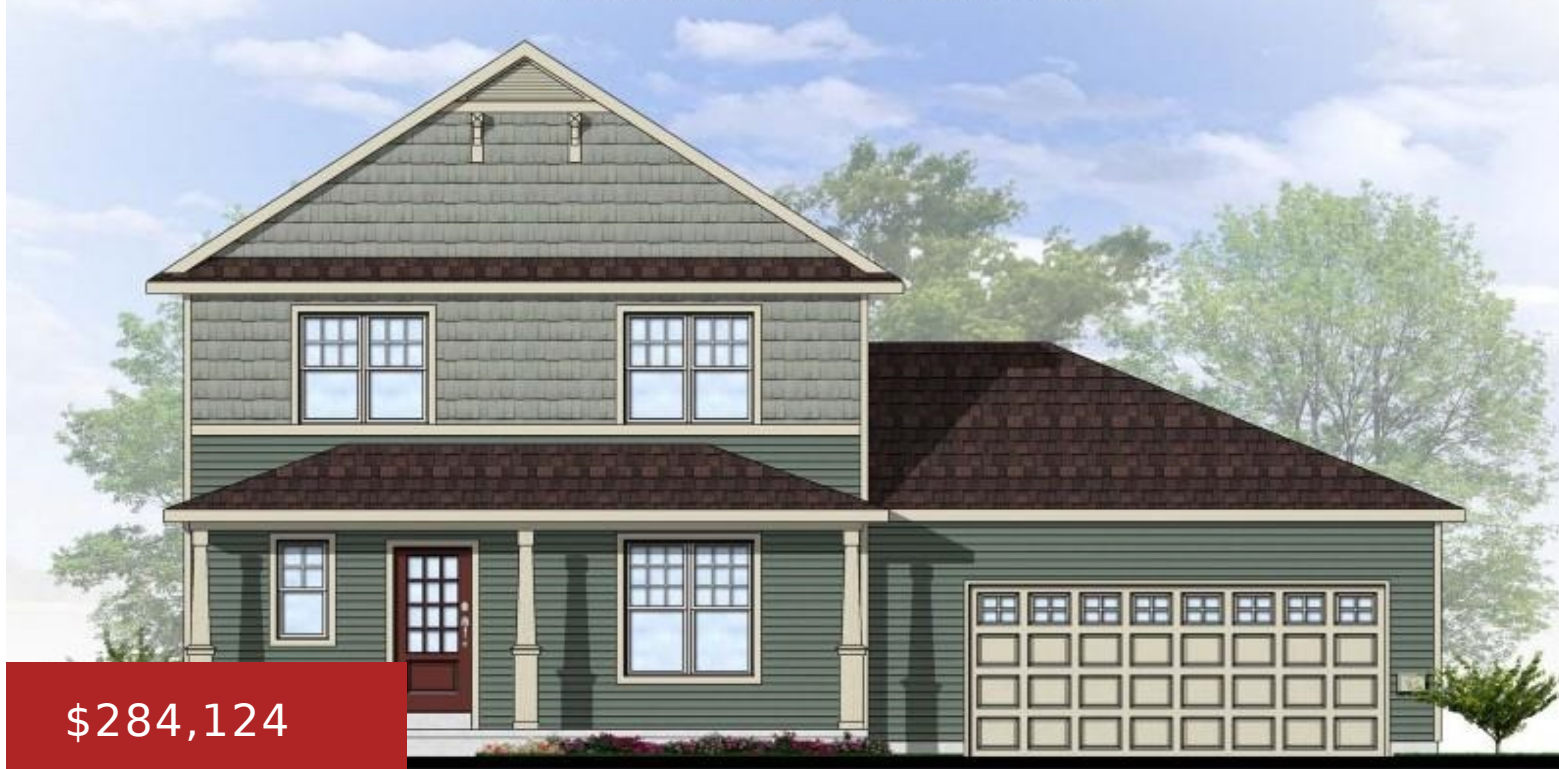
REPRESENTATIVE MODEL FOR COMPARISON

686 Remington Way, Sun Prairie, WI, 53590