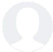
Tyson Adashun Jones, Inc.