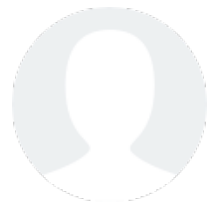
Jason Zellner Real Estate