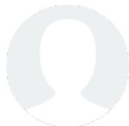
Tyson Adashun Jones, Inc.