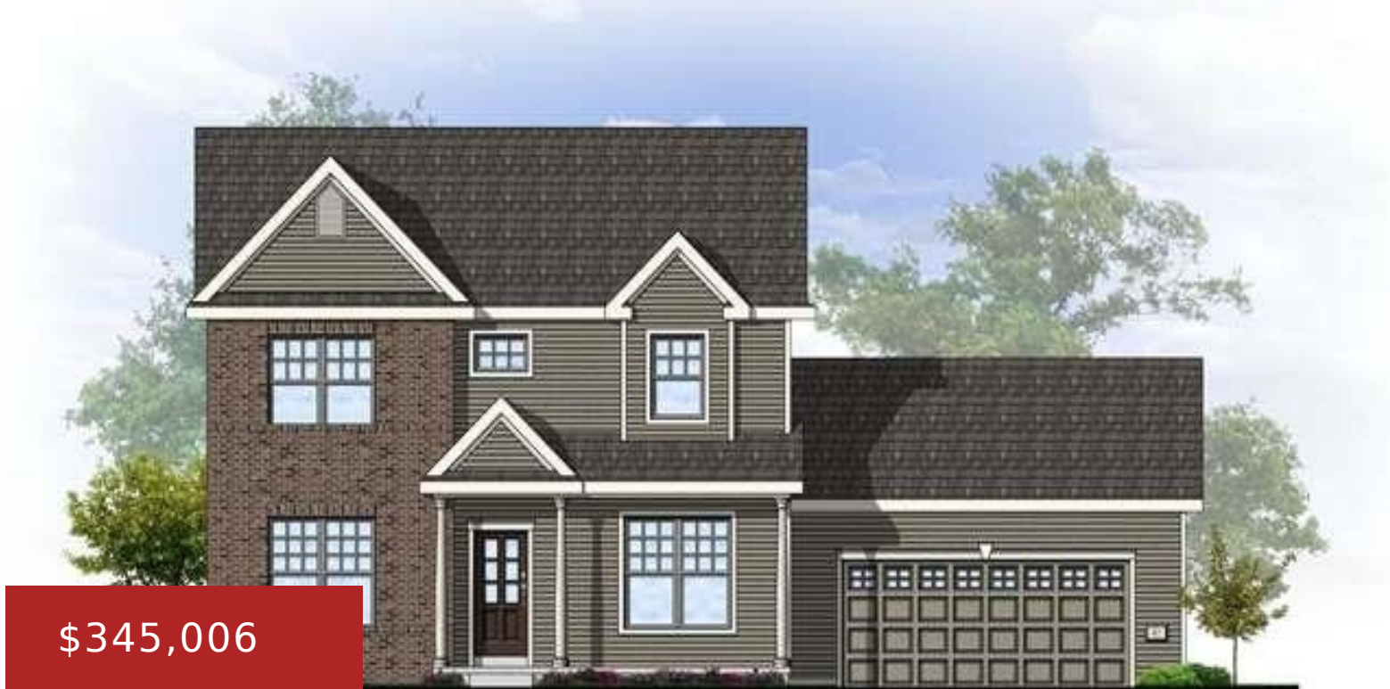
REPRESENTATIVE MODEL FOR COMPARISON

671 Hawthorn Drive, Sun Prairie, WI, 53590