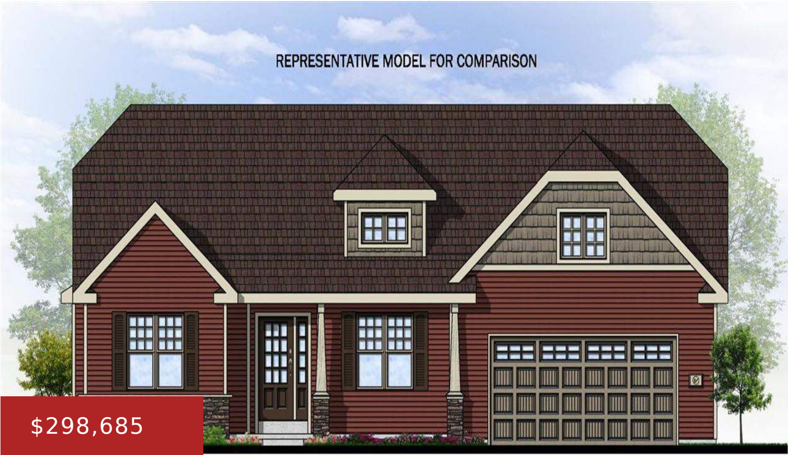
REPRESENTATIVE MODEL FOR COMPARISON

654 Remington Way, Sun Prairie, WI, 53590