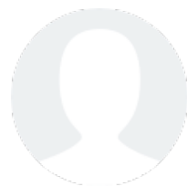
Andy Beiser Realty, LLC