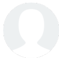
James Olmsted Restaino & Associates