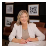
Jan Adashun Jones, Inc.