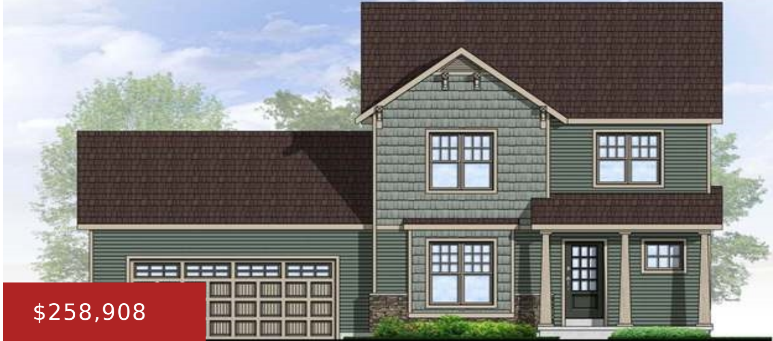
REPRESENTATIVE MODEL FOR COMPARISON