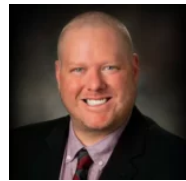
Chris Adashun Jones, Inc.

Used as an Airbnb, this cute 2 bedroom 1 bath home is very well maintained. updated features are just some of the features of this home. Schedule your showing today before it's too late! Seller is requiring a suitable housing clause. Airbnb permit is non-transferable & the new owners would need to re-apply.