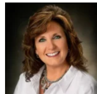
Debra Adashun Jones, Inc.