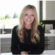
Kelly Adashun Jones, Inc.

Move-In ready Charmer! Step into this cozy and inviting 3-bedroom, 1-bath home that’s ready for you! Enjoy peace of mind with newer furnace, central air, and less than ten year old roof. A private backyard perfect for relaxing or entertaining, and a 3- car garage is a bonus.