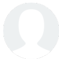
Sheridan Glen First Weber Inc