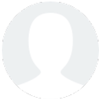
Jordan Premier Legacy Realty, LLC