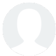
Tom Score Realty Group, LLC

Welcome home by Tom McHugh Construction. This home is will be ready October 1st. 3 bedrooms, 2 bathrooms. 2 car garage. Final streets are paid by the developer, NO street assessments.