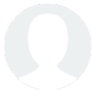
Stephanie Score Realty Group, LLC