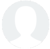
Craig Real Broker LLC