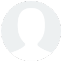
Darren Coaction Real Estate, LLC