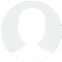
Sam Schrauth Realty, LLC