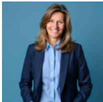
Gail Adashun Jones, Inc.